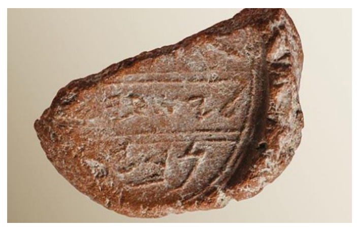
The 2,700-year-old clay seal impression which potentially belonged to the biblical prophet Isaiah..

l'eyesha'yah[u] [belonging to Isaiah]; the damaged left end most likely included the [Hebrew] letter vav. The lower register reads 'n[ah]vy,' centered. The damaged left end of this register may have been left empty, as on the right – with no additional letters – but it also may have had an additional letter, such as an aleph, which would render the word... 'prophet' in Hebrew."