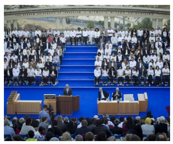
A graduation ceremony at the Hebrew University of Jerusalem

The global employability ranking, designed by the French human resources consultancy Emerging and published exclusively by Times Higher Education, reveals which universities the recruiters at top companies think are the best at preparing students for the workforce. The survey was conducted among thousands of recruiters and managers from a range of firms and industries around the world. Respondents were asked to define what they look for in graduates and which universities they believe produce the most employable graduates.