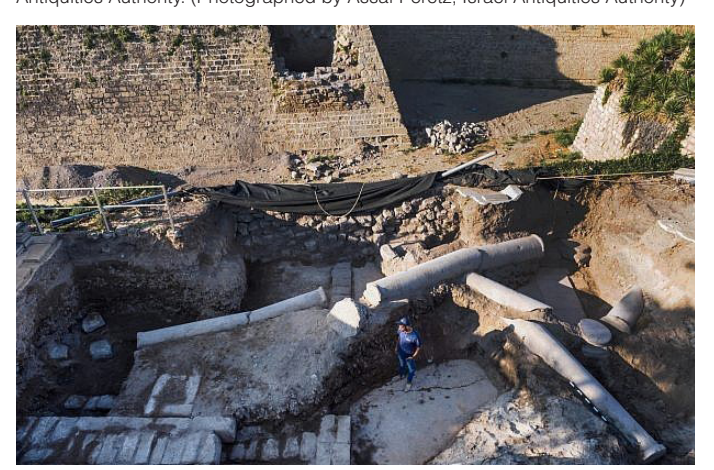
The opulent structure from the Byzantine period, under which the spectacular Roman-period mosaic was found.