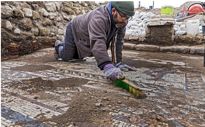
A rare Roman mosaic from the 2nd–3rd centuries CE, bearing an inscription in ancient Greek, uncovered in Caesarea during conservation work by the Israel Antiquities Authority.