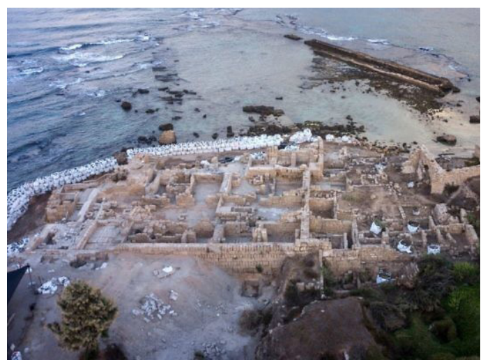
Aerial view of Caesarea National Park

The facelift and expansion of the Caesarea National Park, known for its Roman theatre and Reef Palace, is made possible by a NIS 100 million donation from the Edmond de Rothschild Foundation and the Caesarea Development Corporation.