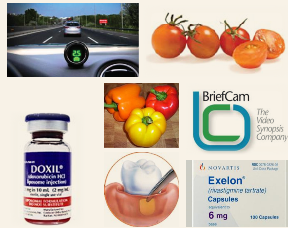
Clockwise from top left: Mobiley, Cherry Tomato Hybrids, Briefcam, Exelon, PeriChip, Doxil, Pepper Hybrids.

Founded in 1964 to protect and commercialise the Hebrew University's intellectual property, Yissum Research Development Company of the Hebrew University of Jerusalem Ltd is ranked among the top technology transfer companies. Yissum has registered over 8,300 patents covering 2,337 inventions; has licensed out 700 technologies and has spun-off 80 companies. Products that are based on Hebrew University technologies and commercialised by Yissum generate today over $2 Billion in annual sales.