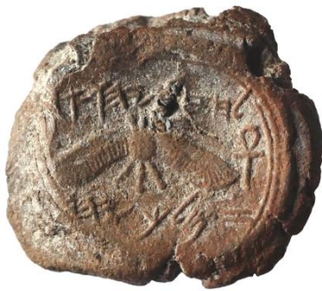
0 1cm